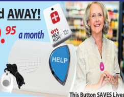
This Button SAVES Lives! As Shown GPS, Lowest Price Guaranteed!